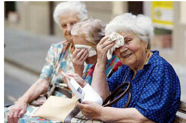
Image credit: http://www.healthspablog.org/heart-health/heart-health-precaution-in-sight-of-the-heat