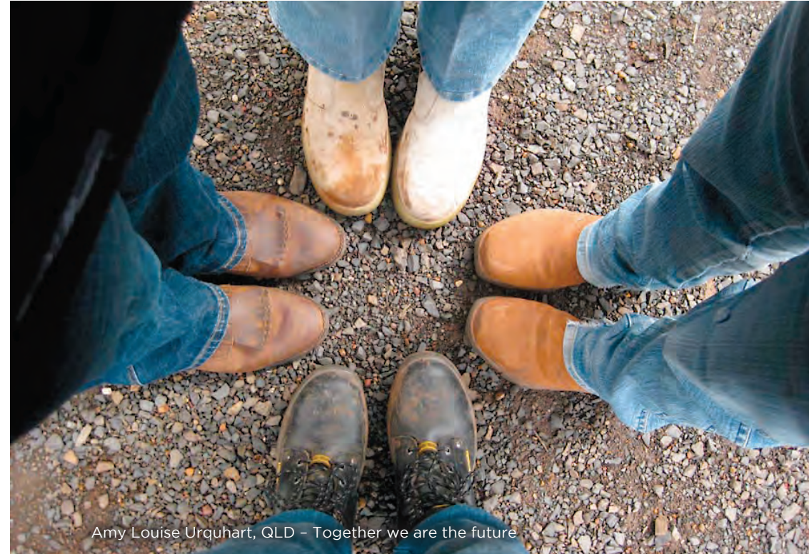
Amy Louise Urquhart, QLD - Together we are the future