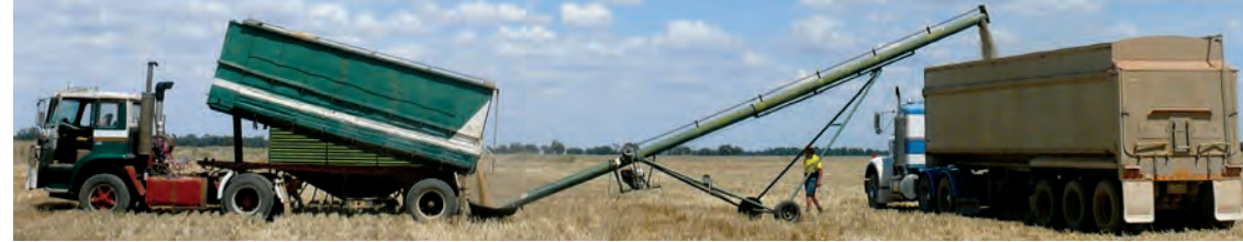
Danielle Phillips, NSW – Dingee Harvest

“I have observed that the lack of rain in October certainly had an effect on health - as things tighten up during the first half of the month and stress levels rose we coped with the initial hurdles, but in the last week or two I have heard of many cases of colds/flu/rundown immune systems (myself and David included – even getting sick on the same day!) Under stress it does seem to be taking us all longer to bounce back as well...”