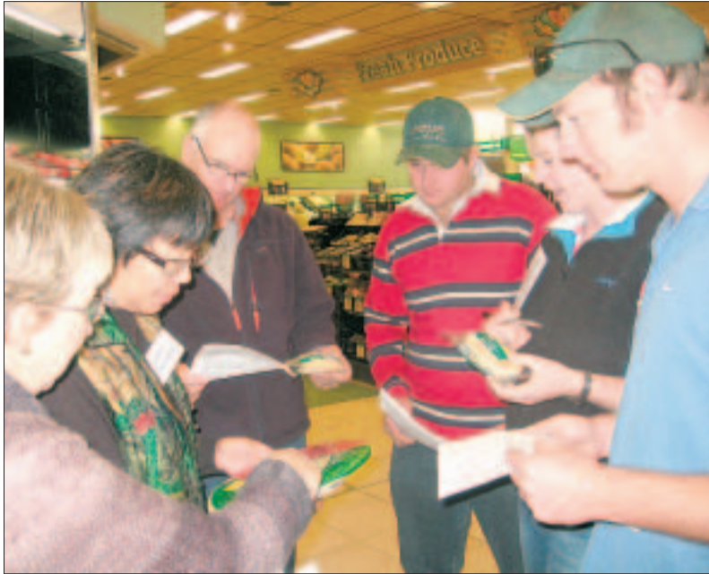
Farmers attended the family health workshop in Rokewood.

"I think the key message is that men and women are genuinely interested in their