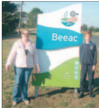
The new sign at Beeac.

The Beeac Progress Association sponsored a competition, with more than 30 residents entering potential designs.