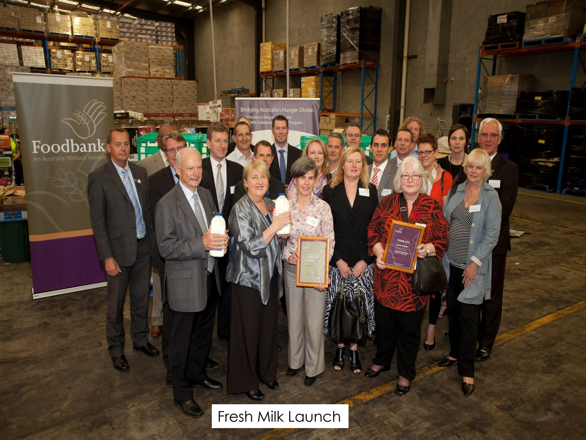
Fresh Milk Launch