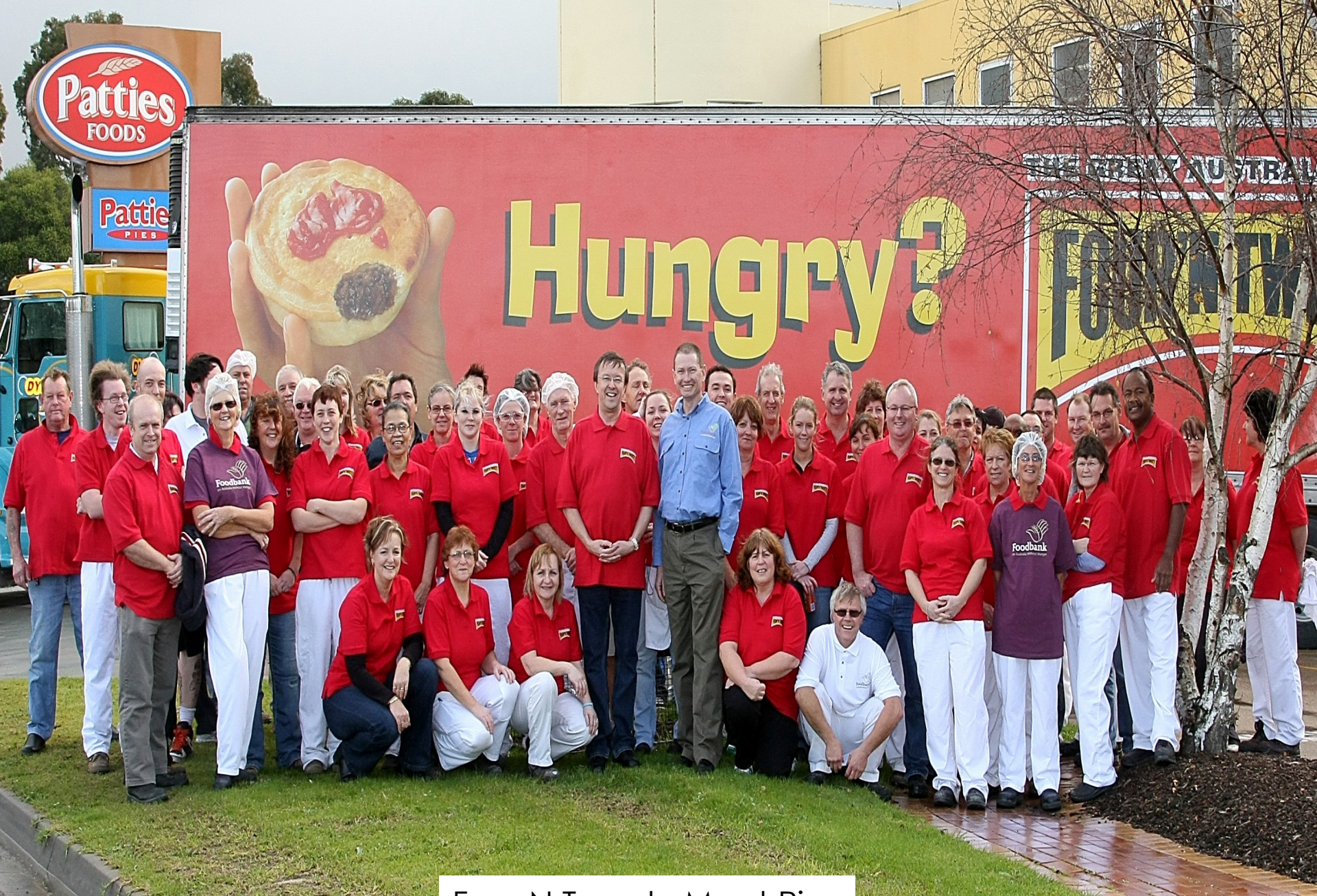
Four N Twenty Meat Pies