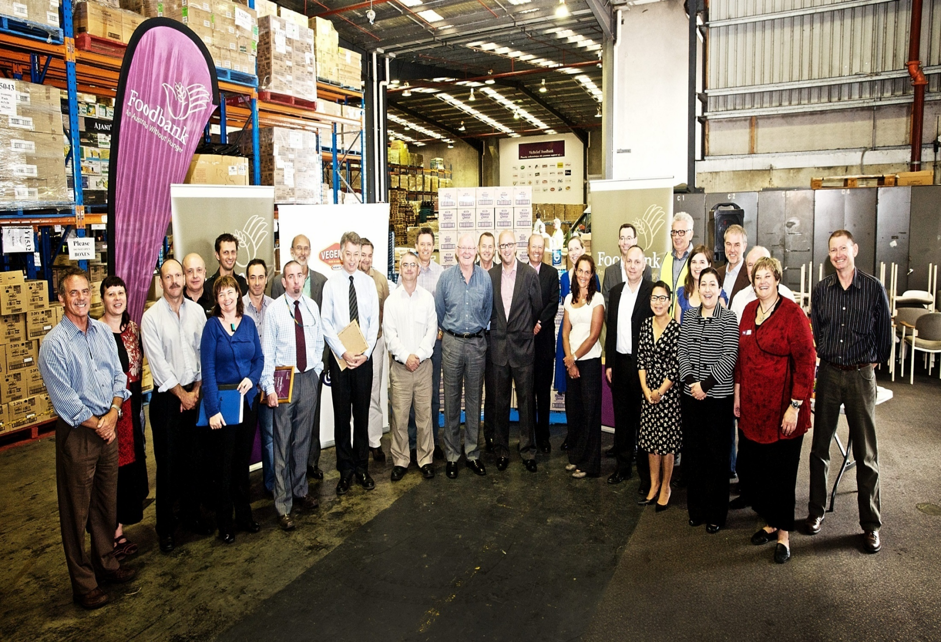
Kraft Macaroni & Cheese